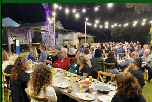
A function at Smirks Heritage Site