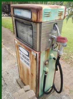
Old fuel bowser